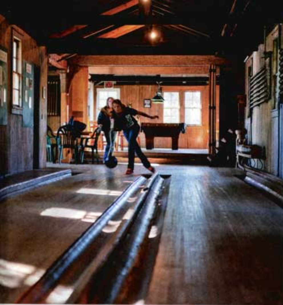
Calvin Coolidge once stayed at White Pine Camp (top). Bathers take a dip at Great Camp Sagamore (below).