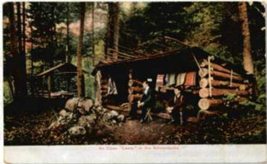
An "open camp" in the Adirondacks (above, shown in 1907) was the type of getaway championed in an 1869 wilderness guidebook by William H.H. Murray (opposite page).

Sadly, his favorite guesthouses have vanished, including Mother Johnson's inn, where "you find such pancakes as are rarely met with." But the general message of the guidebook could not be more valid today. Within a day's drive for 60 million people lie vast swaths of wilderness, including some 3,000 lakes, that are now protected as part of the Adirondack Park—a sprawling 6.1 million acre reserve that is larger than Yellowstone, Yosemite and Glacier national parks combined. The park was created in 1892, as conservationists became concerned at the effects of logging and other industry in the area. The state legislature set aside an initial 680,000 acres to be "forever kept wild" and began pur-